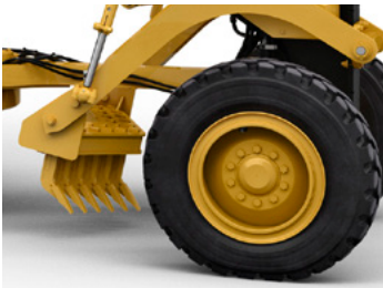
MID MOUNT SCARIFIER