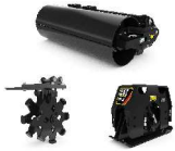
Compactors (CVP16/40) (CV16B/CV18B)