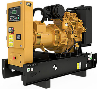
Image shown might not reflect actual configuration