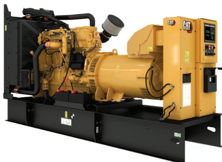
Image shown might not reflect actual configuration