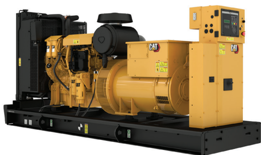
Image shown might not reflect actual configuration