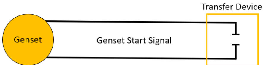
Figure 2: Generator Set Start Signal with Normally Open Contact from Transfer Device

An alternative to this process would be to use a normally open contact, which would be energized when the utility is present to hold the contact closed. When the utility fails and the power is removed from the contact, it will return to the open state, which the generator set controls will recognize as a request for start. The risk with this process is that if the connection between the Transfer Device and generator set were to have a short, the generator set will not recognize the opening of the contact and will fail to start.