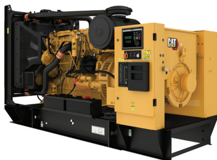
Image shown might not reflect actual configuration