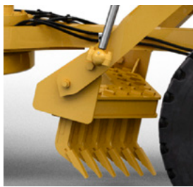
MID MOUNT SCARIFIER