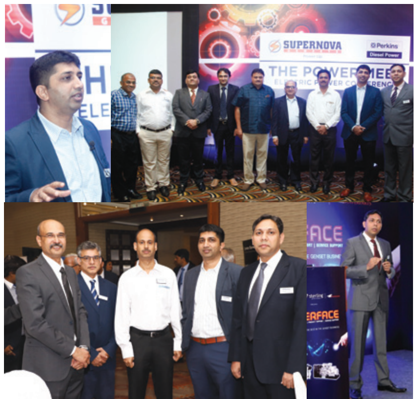
Getting the message: Team members from Perkins and its local distributors joined representatives from various OEM organisations at events across India to talk about the benefits of Perkins electric power offer.

“Raising awareness of our brand, products, standards and services never stops.”