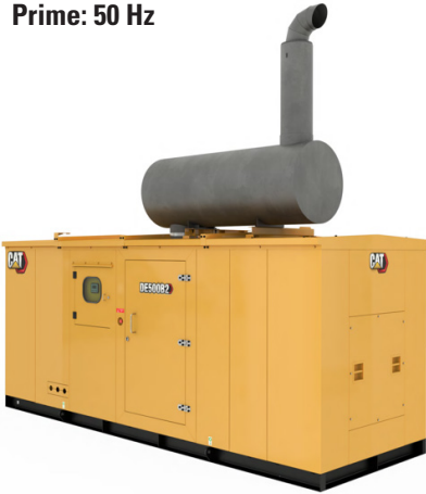
Picture shown may not reflect actual configuration.