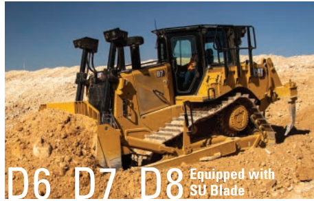
D6 D7 D8 Equipped with SU Blade