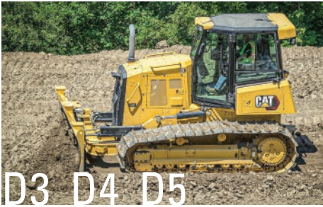
D3 D4 D5