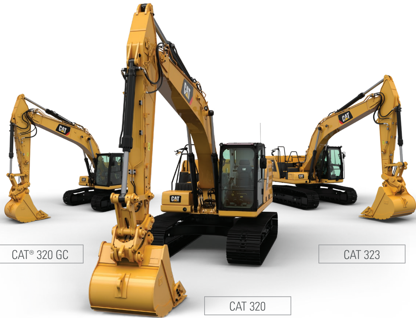
CAT® 320 GC