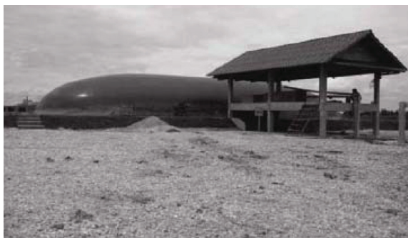
Figure 8: Buffer Tank and Digestion Process in Thailand

As an example of this type of DG application, let us consider the Nong Rai Farm, in Rayong, Thailand. The farm partners with the CP Group, one of the largest food suppliers in Thailand, and runs a feeder operation for more than 30,000 hogs. Nong Rai Farm consumes approximately 200 kW of power for blowers, drying systems and other auxiliary needs associated with its operations. The manure produced by its hogs is piped into a digester pond (see Figure 8), where it generates biogas that is used to fuel the generator sets, which produce sufficient power for all of Nong Rai Farm's electric power requirements.