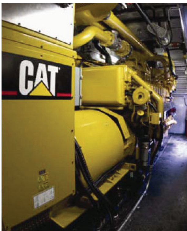
Figure 4: Landfill Gas Engine Generator Set

Landfill gas (LFG) is produced naturally as organic waste decomposes in landfills. LFG is composed of about 50 percent methane, about 50 percent carbon dioxide and small amounts of non-methane organic compounds. At most municipal solid waste landfills, the methane and carbon dioxide are destroyed in a gas collection and control system or utility flare. However, to use LFG as an alternative fuel, the gas is extracted from landfills using a series of wells and a vacuum system. Pipes are inserted deep into the landfill to provide a point of release for the landfill gases. A slight vacuum is then applied in the pipe to draw the gases into and through it to a central point, where it can be processed and treated for use in generating electricity, replacing the need for conventional fossil fuels. The following pages provide a few examples from around the world of how LFG is used to produce electric power through engine generator sets (see Figure 4) in landfill configurations.