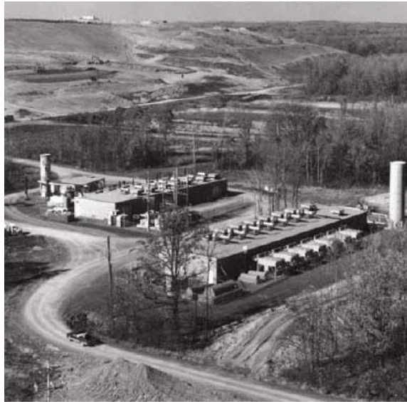
Figure 5: Seneca Meadows Landfill, Seneca Falls, New York

This energy system, owned by Innovative Energy Systems of Oakfield, New York, began operation in 1996 and has been expanded three times to its current 11.2 MW capacity. The system (see Figure 5) uses 14 Cat G3516 generator sets that have been modified for landfill use. Overall energy plant NO x emissions are compliant with local air quality standards.