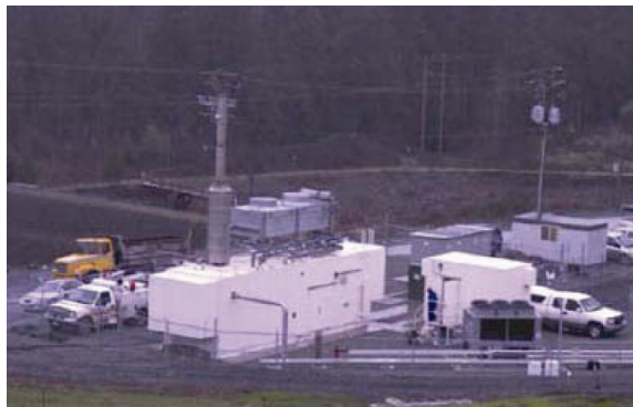
Figure 6: Hartland Landfill, Victoria, British Columbia, Canada

The landfill receives municipal solid waste from a population of roughly 400,000. Until the power generating system went online, the landfill gas had been flared. Independent power producer Maxim Power Corporation of Calgary, Alberta, installed the landfill-gas-to-energy system (see Figure 6). The electric energy output (continuous duty at 1.6 MW) is being sold to BC Hydro for that company's Green Power program.