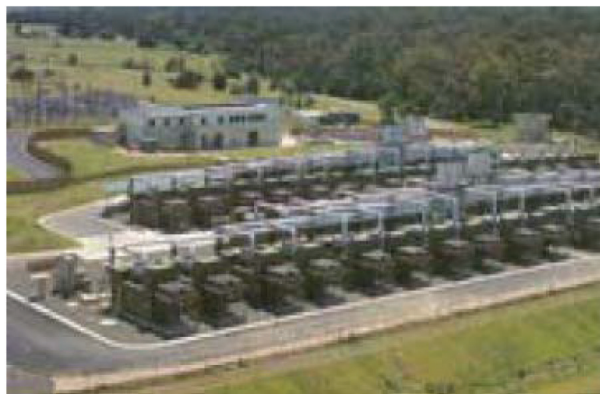
Figure 9: Appin and Tower Coal Seam Energy Project

The Appin and Tower project (see Figure 9) is one of the largest coal seam gas energy systems in the world and one of the world's largest engine-generator installations of any kind. The Appin and Tower projects consume 600,000 \text{m}^3 of coal seam gas per day from two separate mines in New South Wales, Australia. Supplementing with natural gas when necessary, the Appin and Tower project uses more than 90 Cat G3516 lean burn generator sets, each of which produces 1,030 kW of continuous power. As of the summer of 2008, most units had completed over 80,000 hours of operation.