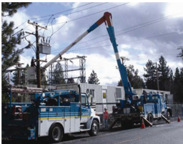
Figure 1: Cat® XQ2000 Power Modules in Chester

Chester's lights remained on and the aging poles were replaced. PG&E avoided the combination of lost power sales during any outage, and the added expense and safety concerns of having to work crews around the clock for 72 hours to replace all the poles.