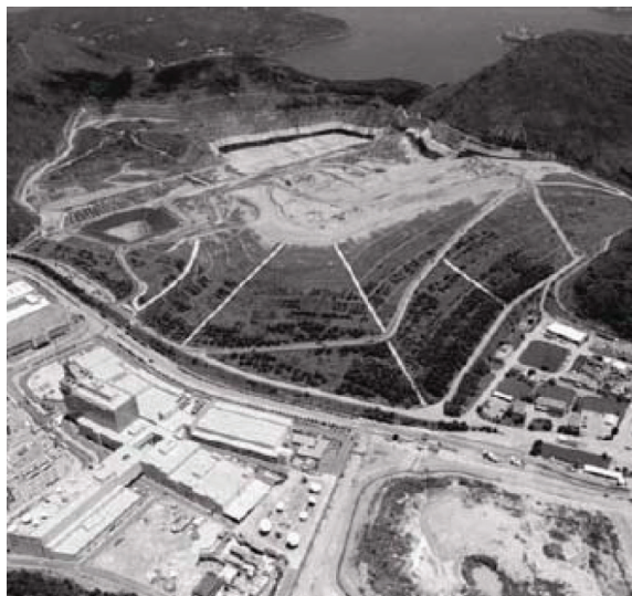
Figure 7: South East New Territories Landfill, Hong Kong

This site operated by Green Valley Landfill Ltd., installed two Cat G3516 landfill generator sets in 1997. Each unit is rated at 970 kW, providing 1.9 MW of continuous power for the landfill infrastructure and an on-site wastewater treatment plant (see Figure 7). The units operate in parallel with the local utility, exporting excess power to the grid. The generator sets have oversized radiators to compensate for tropical heat and humidity.