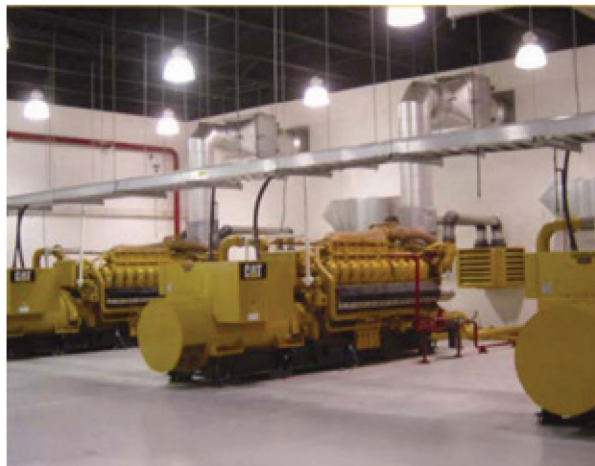
Figure 2: DG in Hurricane City Power Plant

The reliability and cost-effectiveness of this power solution earned Hurricane City Power and Washington City Power a joint award in 2007 for the "Most Improved System of the Year" from the Utah Associated Municipal Power Systems (UAMPS). The city has been able to save as much as $10,000 to $12,000 a day because of its ability to react to market prices quickly, and run the generators instead of buying power on the market when the cost is high. In addition to cost savings for the city, the generator sets provide peak power production support and backup power in case of a citywide blackout. Three area blackouts have occurred in the three years since this system has been in place, and the generator sets have provided the power needed to get the city up and running when no outside power was available.