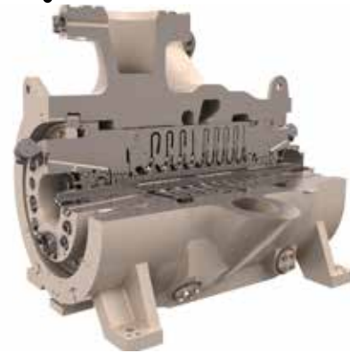
C41 Dual Compartment Sectional View