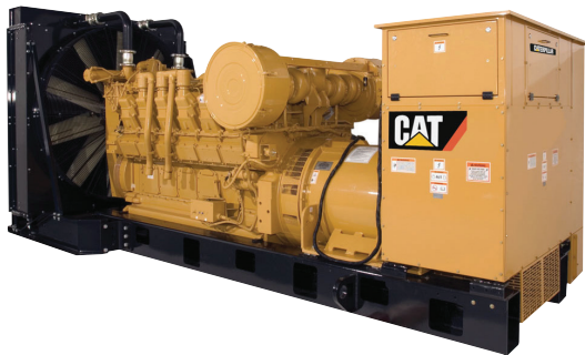
Image shown may not reflect actual configuration