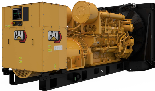
Image shown may not reflect actual configuration