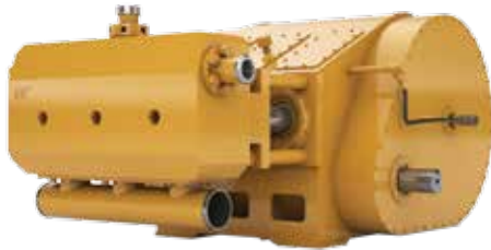
Image shown may not reflect actual pump configuration