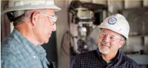
Solar and customer identify turbine ready for overhaul