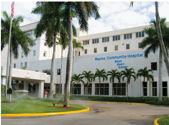
NCH HEALTHCARE SYSTEM – NAPLES, FLORIDA, USA

When it comes to health care facilities, losing power could have unthinkable consequences. Lives are on the line, and every second counts. Below are a few of the health care facilities that turned to us to serve as the backbone of their business.