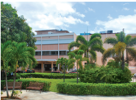
BELLA VISTA HOSPITAL – MAYAGÜEZ, PUERTO RICO