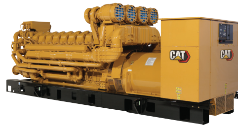
CAT® DIESEL GENERATORS 12 to 17,460 kW / 15 to 21,825 kVA

Health care facilities reduce operating costs by implementing a combined heat and power (CHP) system using clean pipeline natural gas as a fuel source. Cat gas generator sets can simultaneously provide electricity for electrical loads and convert waste heat into a server cooling source via absorption chillers. The result is a power system with energy efficiency up to 90 percent, reduced energy costs, and Energy Efficiency Points toward Leadership in Energy and Environmental Design (LEED) Certification.