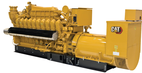
CAT GAS GENERATORS 66 to 6,520 kW