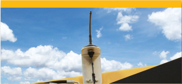
Product Link™ and VisionLink™ Collects machine data and transmits to customer and dealer. VisionLink software makes data useful.