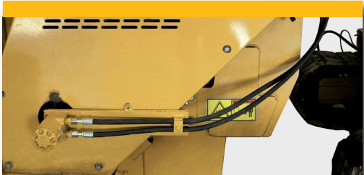
Rotor Turning Device Hydraulic motor attachment turns rotor for easy maintenance, less effort to change bits.