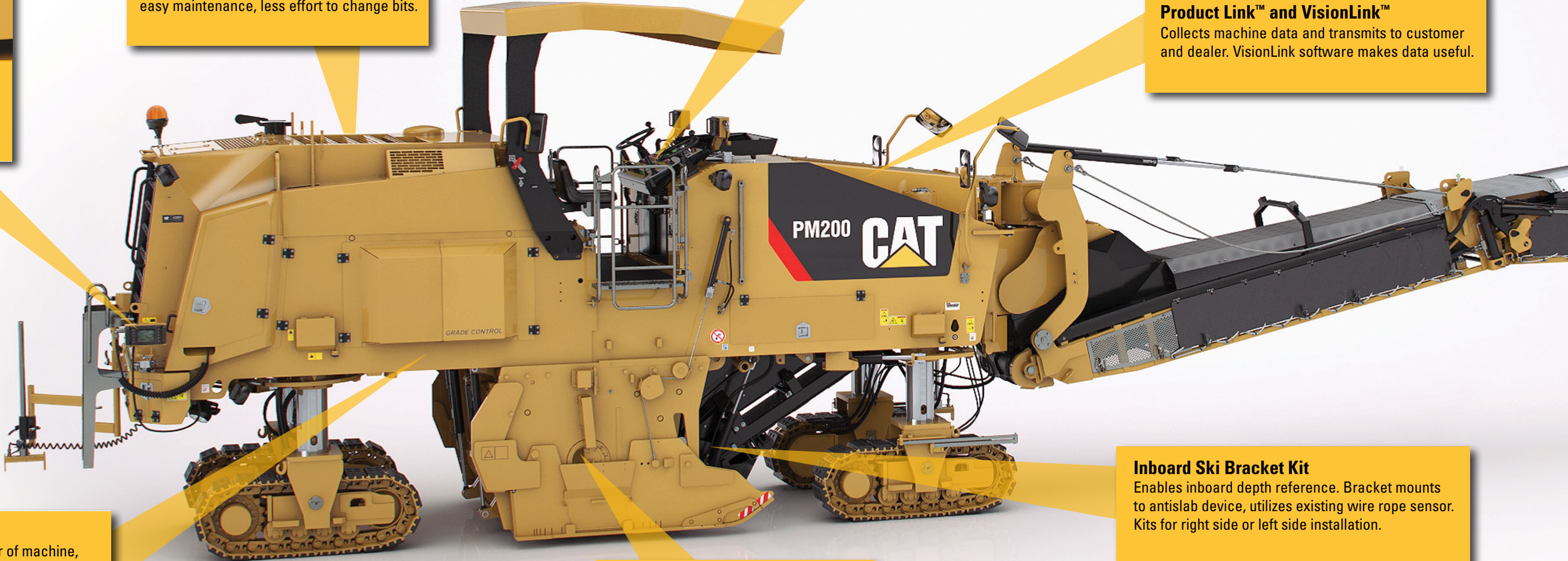
Rear Water Fill Kit Enables water fill from rear of machine, or fill during production.