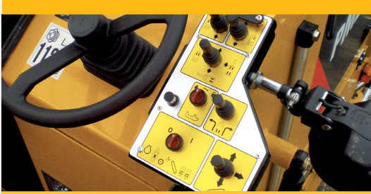
Dual Control Panel Enhanced ergonomics, fingertip control of key operations on both sides of machine, easier to line up, cut and keep eyes on track.