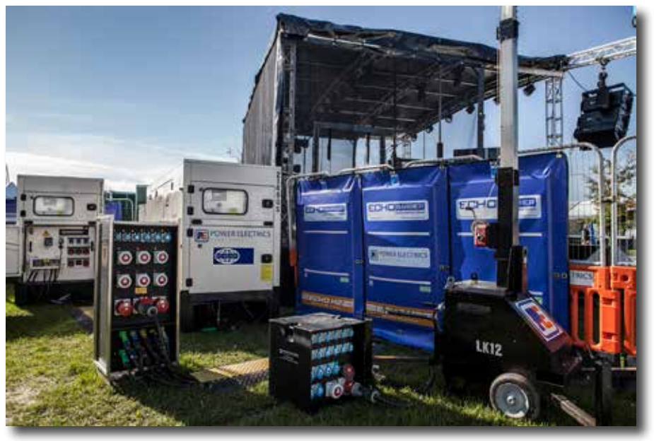
Two 200 kVA generator sets providing prime and standby power to a festival stage in Somerset, UK.