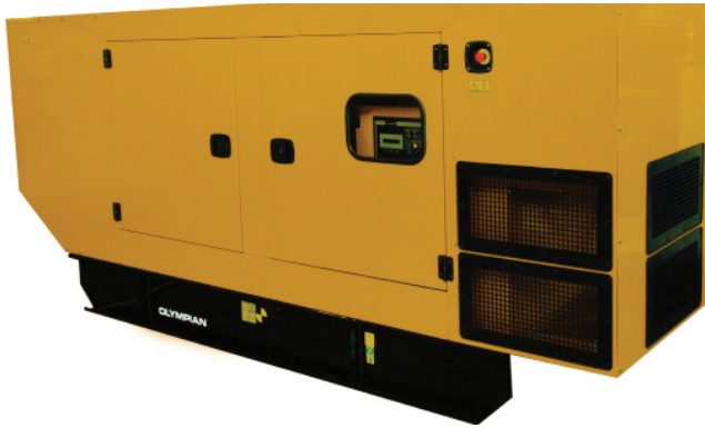
Enclosure pictured may include optional accessories