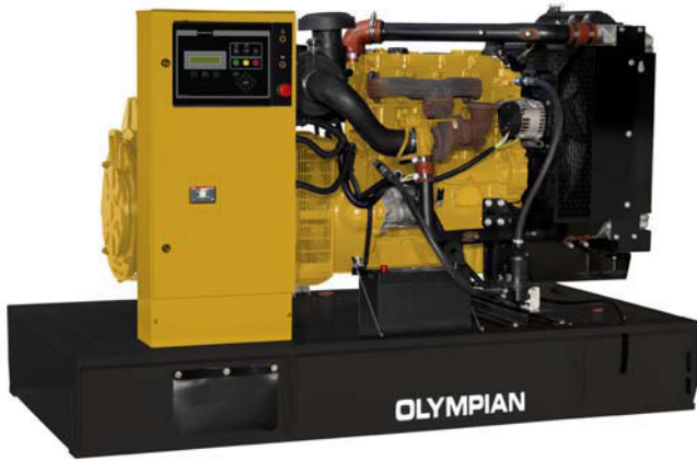
Image shown may not reflect actual package

Diesel Generator Set Exclusively from your Cat® dealer