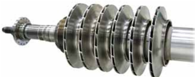
Typical C61 Rotor