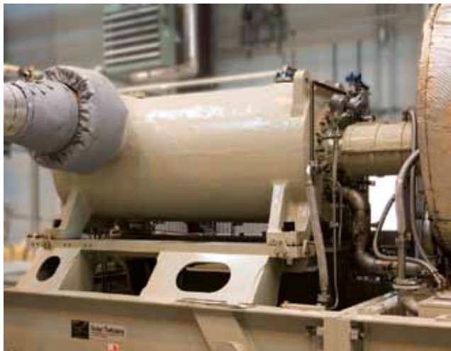
C51 Gas Compressor

The C51 gas compressors have the latest state-of-the-art technology combined with the experience and reliability that comes with building and installing over 5000 compressors. These compressors are designed in compliance with API 617, a requirement for the severe environments and operating conditions this equipment may encounter.