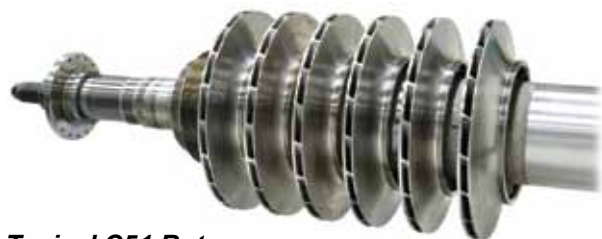
Typical C51 Rotor