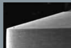
New valve seat prior to testing