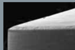
Valve seat after testing with new UHE+ fuel filter