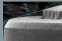
Valve after testing with conventional filter