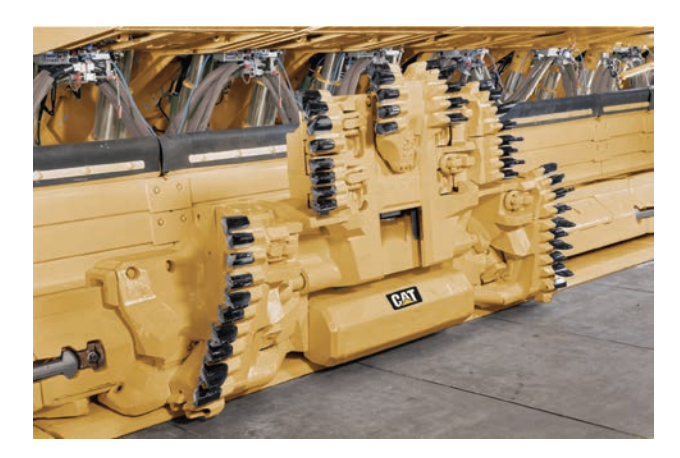
High-horsepower Cat GH1600 Gleithobel plow system (max. 2 x 800 kW)

The latest plow model is a redesign of the standard GH800, built on experience gained from the GH1600 plow system—especially with regards to the cast plow guide. The new GH800B also uses a one-piece casting for the plow guide, allowing for a very low guide height and thus easy loading of the coal onto the face conveyor. The first system of this type has finished its first very successful panel at RAG Deutsche Steinkohle's Ibbenbüren Mine in spring of 2014 in a seam around 80 cm thick.