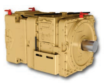
Upgraded version of the CST gearbox with integrated pump motor