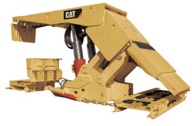
Cat LTCC roof support with front and back AFC

This system, like all Cat roof supports, is characterized by thorough design, inlcuding FEA analysis, superior welding quality proven by successful structural testing, and extended underground life allowing for minimum longwall operating costs.