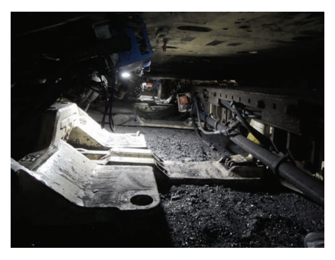
Cat roof supports specifically designed for low-seam operation