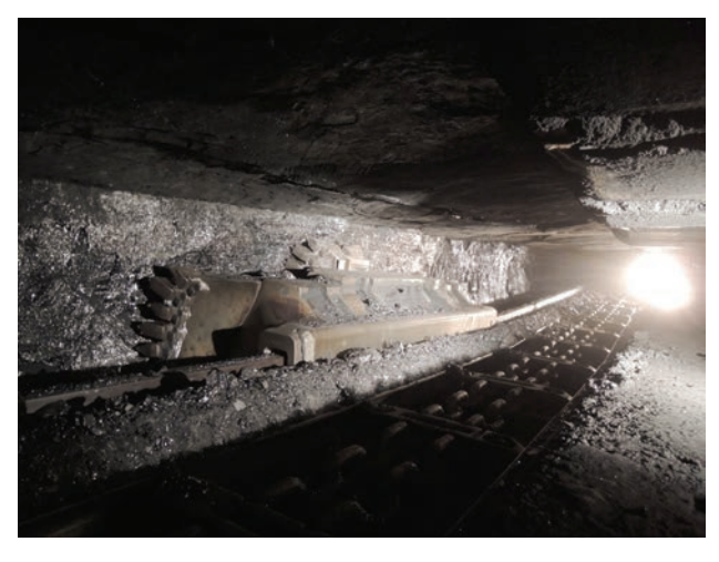
New Cat GH800B Gleithobel plow at Ibbenbüren mine