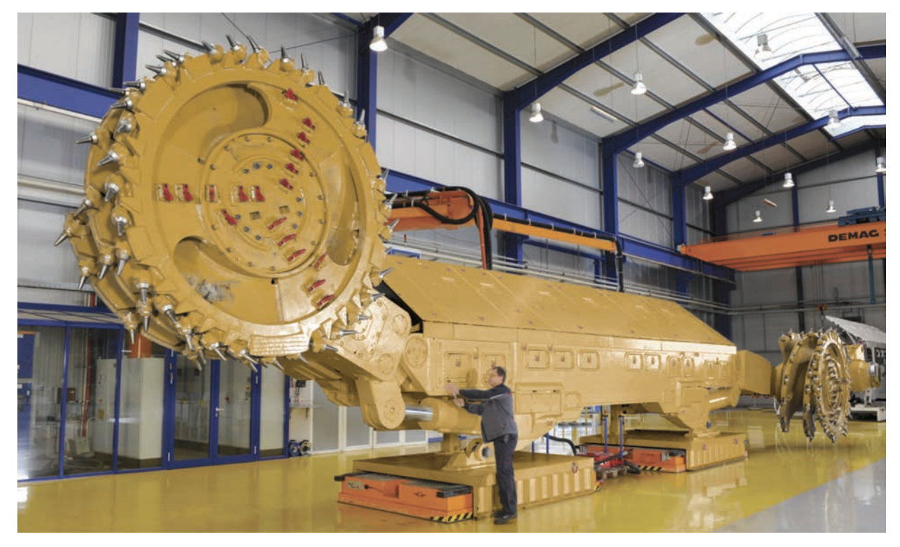
New Cat EL3000 shearer during final testing at Caterpillar in Lünen

The first next-generation Cat EL3000 shearer went to work in 2012 in Australia's Narrabri mine as part of a complete Cat LTCC system. Several more shearers of the same size are now in operation—primarily in Australia. Mines are also using the smaller EL1000 and EL2000 machines. All use common, newly developed control hardware and software, allowing more automation features while making maintenance and fault-finding easier than ever before.