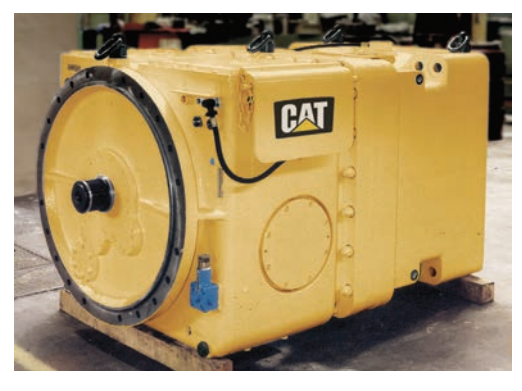
Traditional Cat CST gearbox (from 500 to 1.800 kW installed power)

The first of these innovative drive systems has been in successful operation at Bogdanka Mine in Poland since 2012. It is part of a complete Cat plow system that includes a Cat variable frequency drive (VFD) to operate and control the speed of the face conveyor and the plow motors.