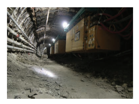
Cat VFD system underground