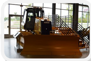
D5K2 Track Type Tractor