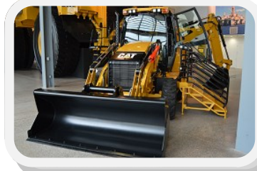
908H Compact Wheel Loader