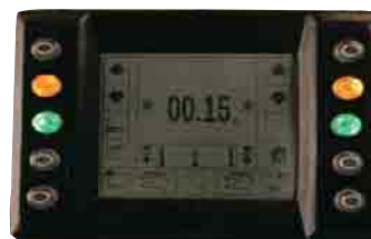
AccuGrade Laser Display