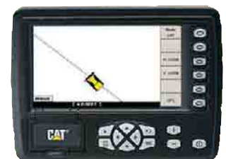
AccuGrade GPS Display