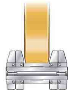
SystemOne Center Tread Idler