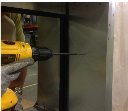
Also screw to side panels and base to frame