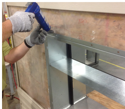
Caulk sides and top rails to building face.