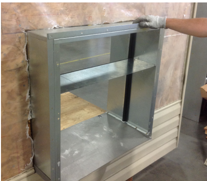
Insert sleeve into wall opening