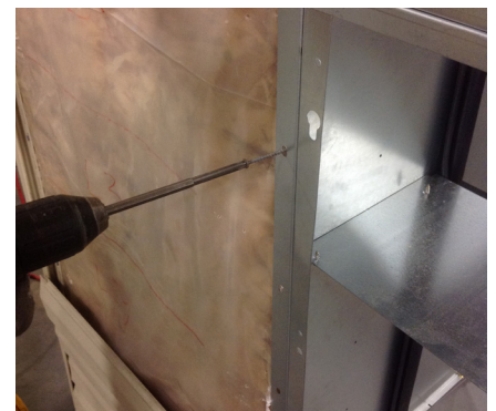
Screw to building face