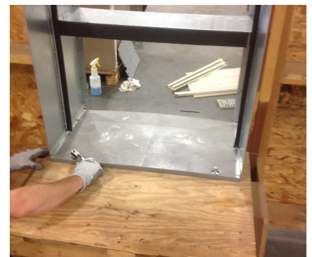
Bolt base to wooden platform