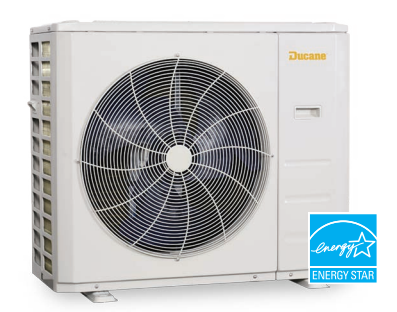
4DHP2 Comfort control for the whole home.

The 4HP17L delivers increased energy savings with efficiencies of up to 17 SEER (16.2 SEER2) and 8.8 HSPF (7.5 HSPF2) when paired with a matched furnace or air handler. To help you get the most out of your HVAC system, your local dealer can recommend the right pairing for your home.