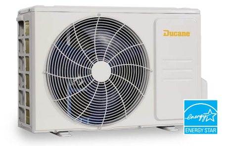
4DHV2 The right temperature, right where you want it.

This ENERGY STAR<sup>®</sup> Most Efficient multizone ductless outdoor unit, offering ratings up to 25.5 SEER (25.5 SEER2) and 13.2 HSPF (11.9 HSPF2), works with up to five indoor modules. That allows you to set each room to a different temperature, helping to maximize comfort and energy efficiency.