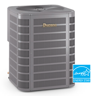
4HP17L Reliable heating and cooling.

The 4HP17L delivers increased energy savings with efficiencies of up to 17 SEER (16.2 SEER2) and 8.8 HSPF (7.5 HSPF2) when paired with a matched furnace or air handler. To help you get the most out of your HVAC system, your local dealer can recommend the right pairing for your home.