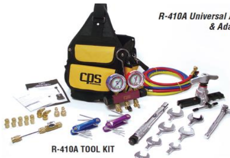
R-410A Universal A/C Tool & Adapter Kit