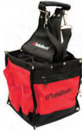
(0386-1402) Deluxe Torch Bag