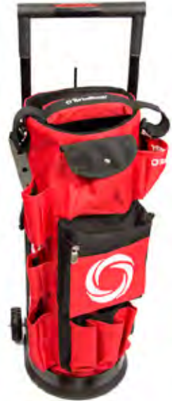
(0386-0579) Rolling Tote Bag