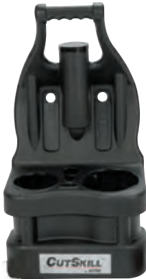
(1421-0084) CutSkill® Tote Only