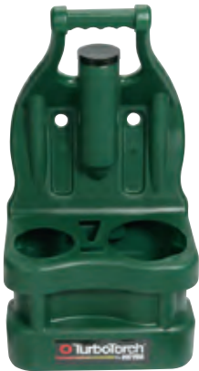
(0386-1241) Turbo Tote Only