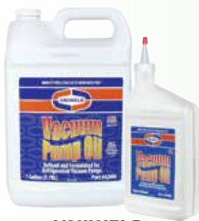
UNIWELD VACUUM PUMP OIL

Part# 42005 (1) Quart (946 ml) 12 per case