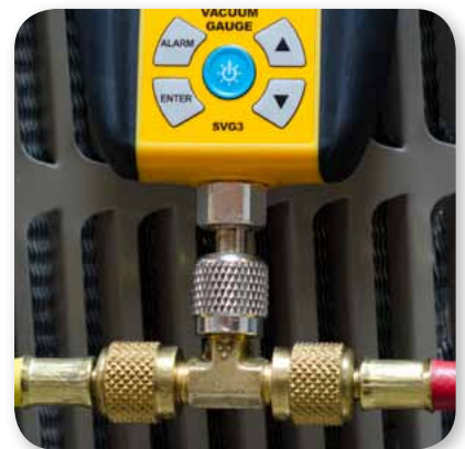
Traditional: In-line Between System and Vacuum Pump