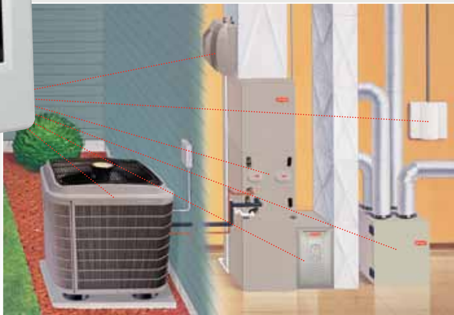
Bryant® Evolution® Heat Pump and Fan Coil System controlled by the Evolution® Connex™ Control

As with all of our products, your local Bryant dealer is the key to putting it all together. He can analyze your needs and show you all of the reasons why a Bryant Evolution Connex Control can be such a great choice for your comfort and satisfaction.