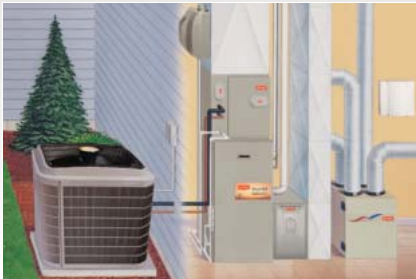
Air Conditioner and Gas Furnace System