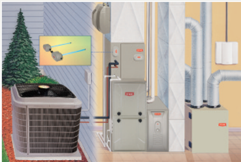
Air Conditioner and Gas Furnace System