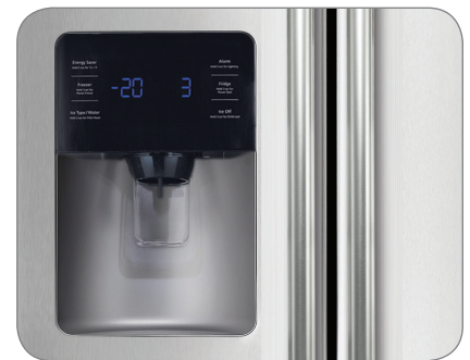
External Filtered Water and Ice Dispenser