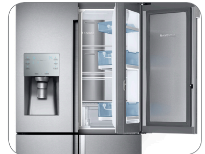
Food Showcase Door with Metal Cooling