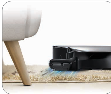
Powerful Robotic Suction