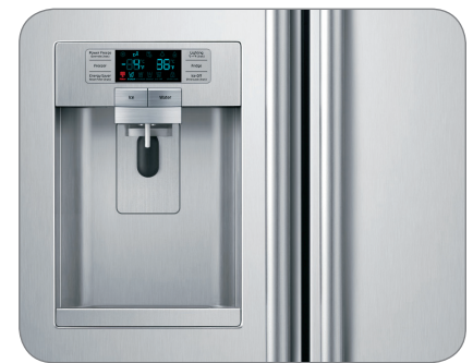
Premium External Filtered Water and Ice Dispenser