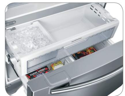
Filtered Dual Ice in Freezer