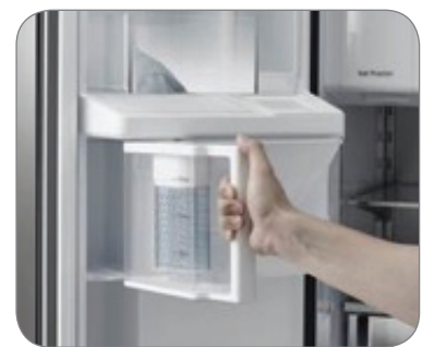
Auto Water Fill