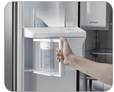
Auto Water Fill