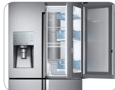
Food Showcase Door with Metal Cooling