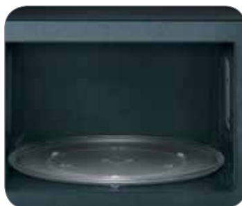
Ceramic Enamel Interior