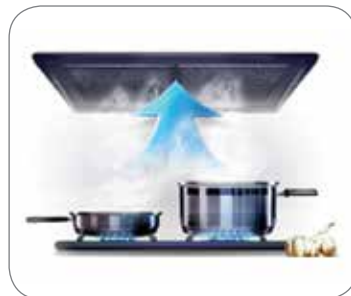
2-Speed/300 CFM Ventilation System