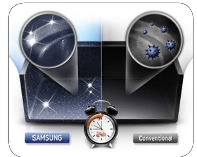
Ceramic Enamel Interior