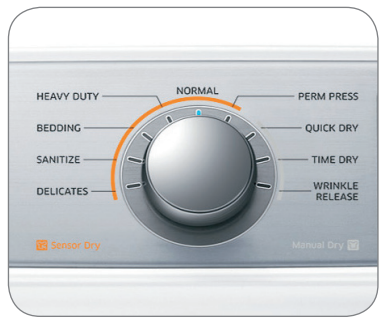
9 Preset Drying Cycles